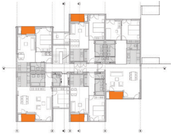
housing L floor plan