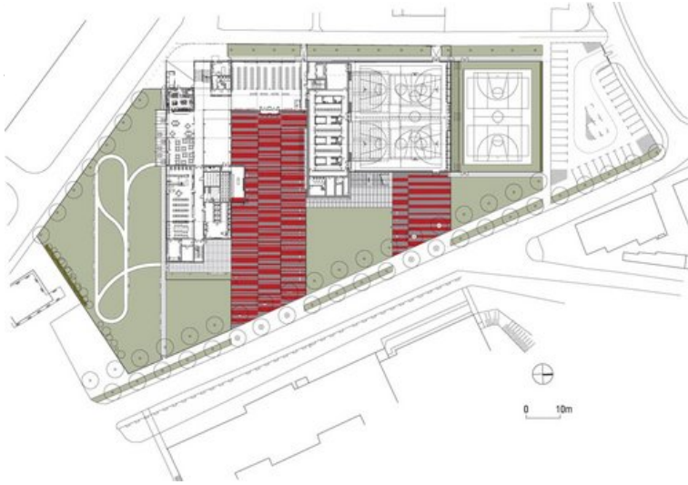
The secondary medicinal highschool situation