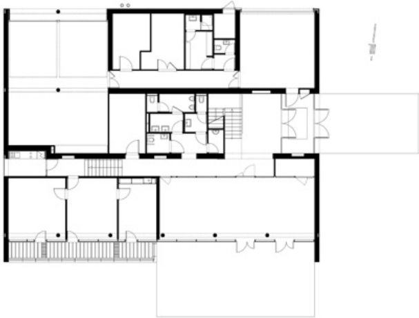
ground floor plan