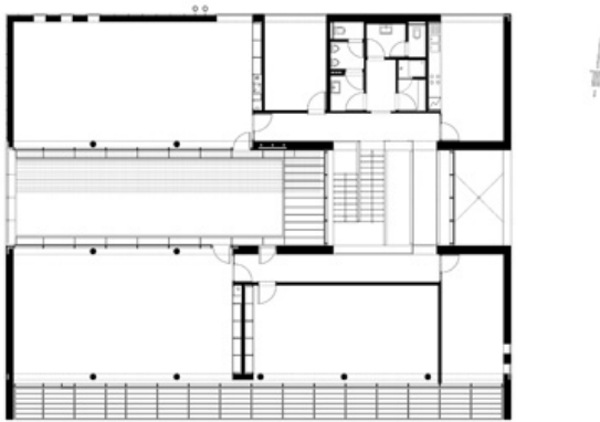
first floor plan