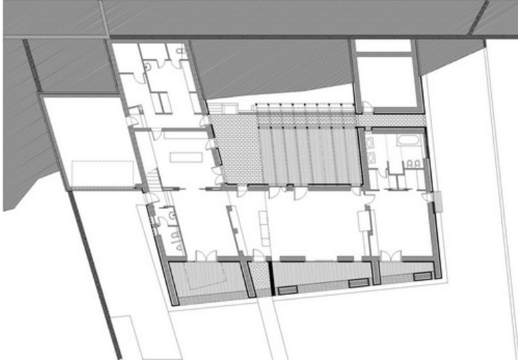
Green roof house